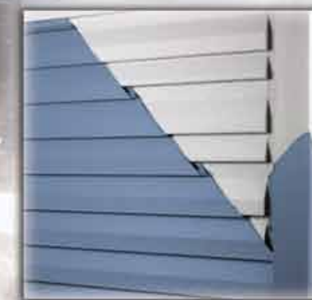
Charter Oak Energy Elite shown in Mystic Blue.

Average siding can bow or bend over time. Charter Oak Energy Elite is fully supported to stay rigid for the life of your home. Laps won't open and the appearance of premium wood siding is complete.