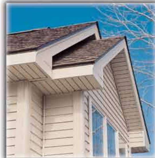
Charter Oak invisibly vented soffit.