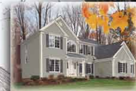
Subtle contrast unifies your home's architectural elements. Shown here: Coastal Sage siding, Antique Parchment trim, Storm Gray shutters and White door.

Please note: We strongly recommend that you make your final color selections using actual vinyl samples. Colors in this brochure are only as accurate as printing techniques allow.