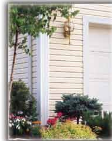
Trimworks fluted corner post featuring Fullback for increased durability.