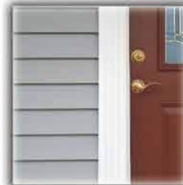
5" Trimworks fluted lineals complement a beautiful decorative door.