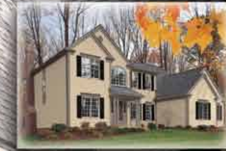
Greater contrast emphasizes individual architectural elements. Shown here: Vintage Wicker siding, Tuscan Clay trim, Black shutters and Brown door.