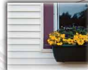
Trimworks custom crown molding with wood window trim.