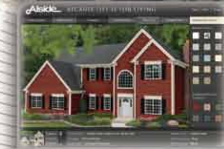
Want a great way to view Alside siding, accent and trim color combinations? Alside's Design Showcase is an interactive color visualization tool that makes choosing siding, accent and trim colors easy, effective and exciting . . . all with just a click of the mouse. Visit www.alside.com to get started.