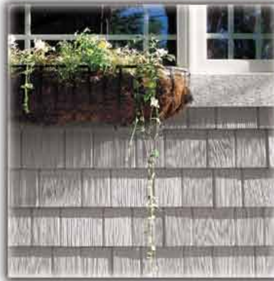
Alside Premium Shakes create the classic look of deep-grained cedar shakes.