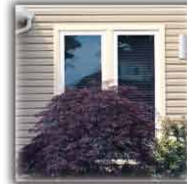
Charter Oak Dutch lap with Trimworks 3 1/2" window trim.