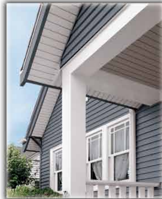
The ColorConnect color matching system ensures that trim details complement each other perfectly.