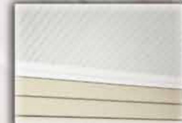
Greenbriar® Vintage beaded soffit and Trimworks soffit crown molding.