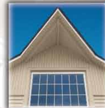
Charter Oak vertical siding and soffit.

Many Charter Oak Energy Elite trim and accessories have Fullback® inside to make the energy efficiency and durability of your siding complete. For example, our beaded and fluted corner posts feature Fullback inside to add rigidity, insulation, and 300% greater impact resistance. Small animals, birds and insects can't nest in these corners.