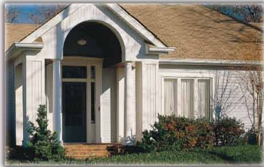
The artful contrast of vertical and horizontal siding creates an almost cathedral-like impression at the home's main entryway.

It's easy to create distinction and appeal using Charter Oak Energy Elite's beautifully crafted detailing to emphasize your home's important architectural elements.