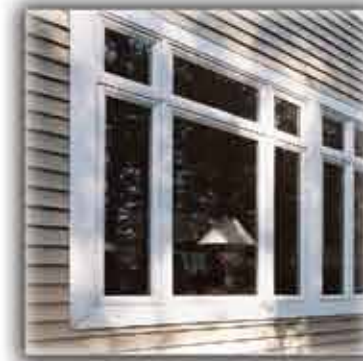
Charter Oak clapboard with Trimworks 5" window trim.