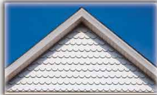
Alside Premium Scallops are half-round shingles inspired by Victorian masterpieces.